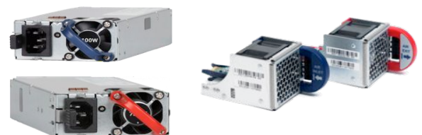
Hot swap and reversible power supply and fan modules